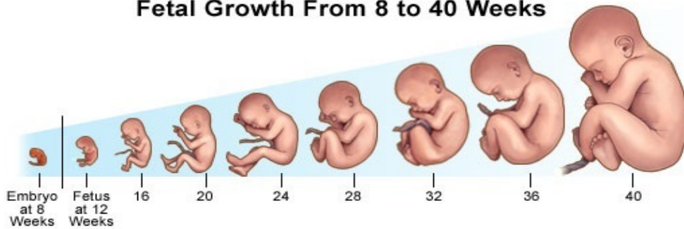
Fetal Growth From 8 to 40 Weeks